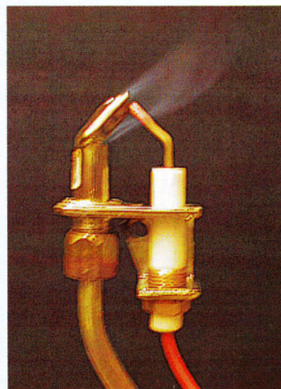
The spark pilot offers convenience and economy.

Unlike the traditional millivolt control, the Sunglo™ 'E' Series does not utilize a thermocouple. Instead an electrode replaces the traditional thermocouple, providing both the functions of ignition and flame sensing.