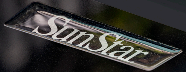
FEATURED MODEL: 50SGL - 3MIL BLACK POWDER COAT

Now available with up to 50,000 BTU/HR output providing two-stages of reliable warmth for any outdoor space. Made In The USA , it is the perfect heating solution for cooler days and nights.