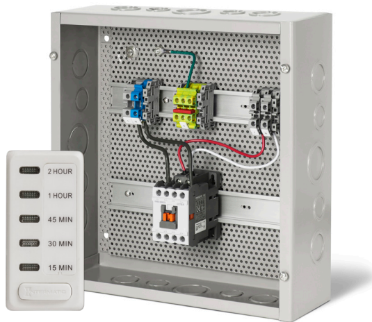
14-4700 CP-6000-1X Single Contactor Panel w/Cover — Digital Timer included