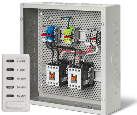
14-4710 CP-12000-2X Dual Contactor Panel w/Cover — Digital Timer included