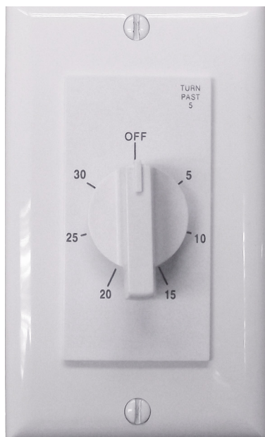
# 93502 - 30 Minute Timer Shown