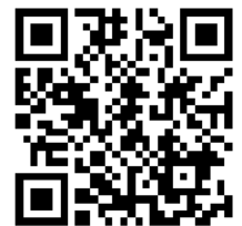
Patio Heater Video