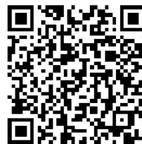
Patio Heater Catalog