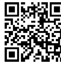
Find a Distributor