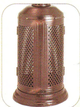
Close up detail base