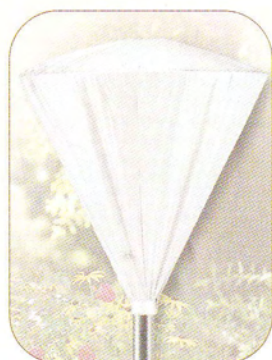
Hood Cover (Optional Accessories)

Please note: We have made every effort to make our heaters as safe, easy to assemble, and durable as possible. However, improper use, installation, adjustment, alteration, or maintenance of heater can cause property damage, injury, or possibly death. Please read instruction manual thoroughly before using, installing, or repairing this product. Please contact us if you have any questions whatsoever about the safe operation of this product. Due to our ongoing commitment to product improvement, prices, specifications, and materials subject to change without prior notice.