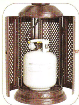
Tank in enclosure (tank not include)