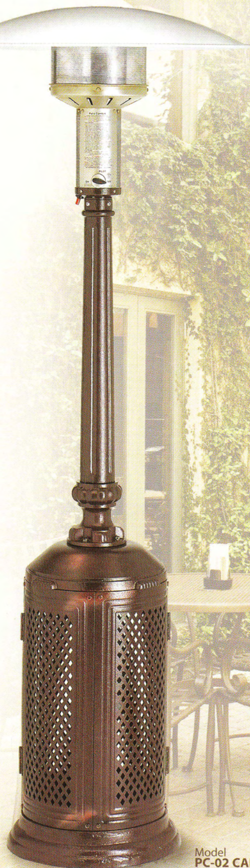
Model PC-02 CAB